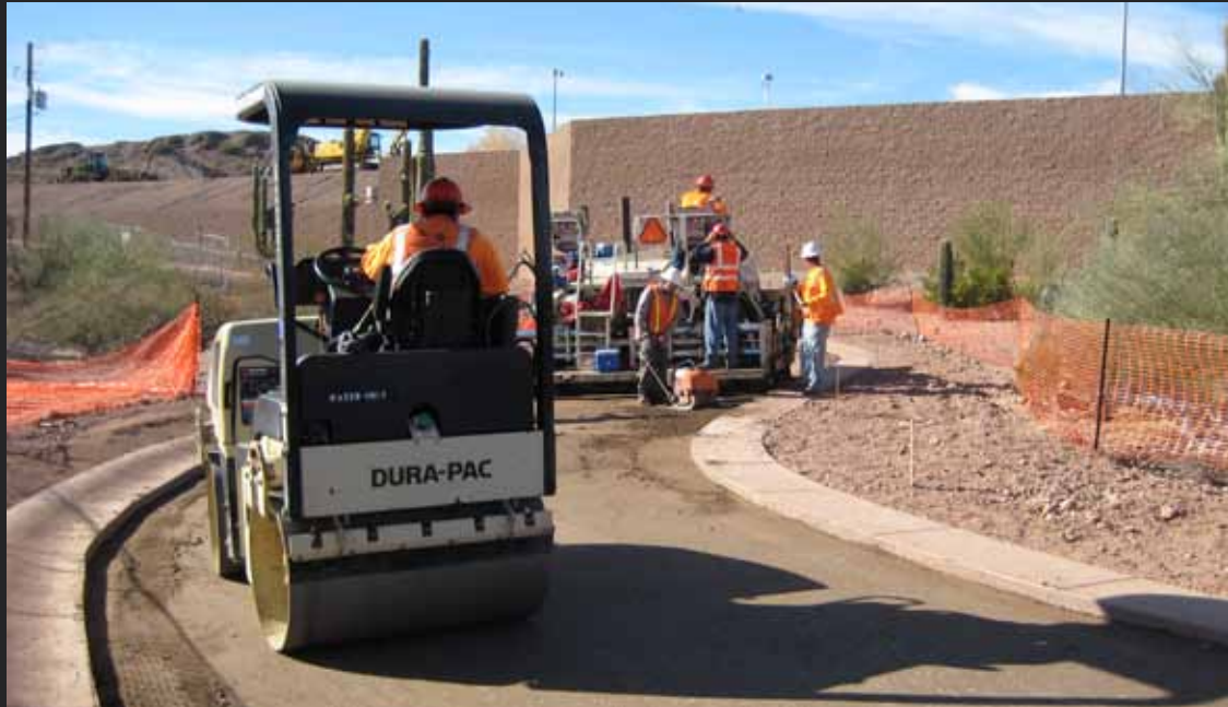
Paving Machine Placement