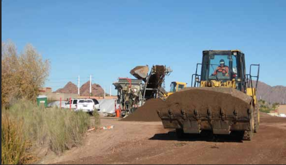
Plant Mixing Operation