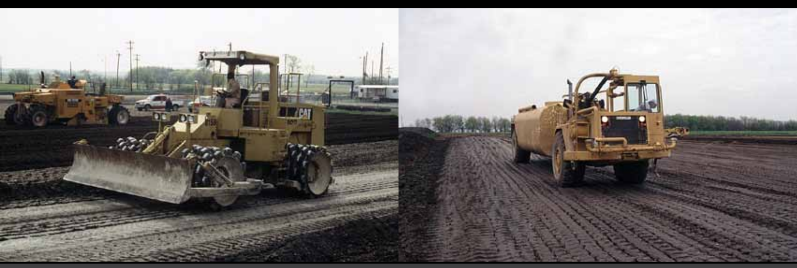
Compaction of Treated Clay Soil