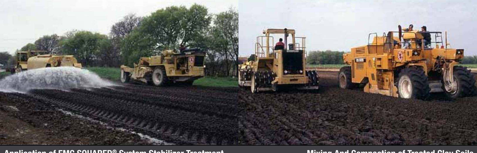
Application of EMC SQUARED® System Stabilizer Treatment